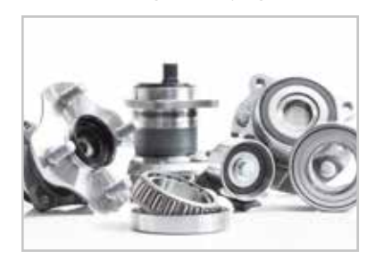
Bearings and couplings