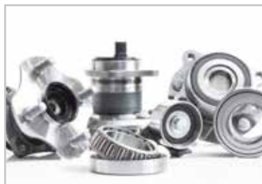
Bearings and couplings